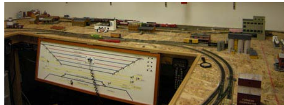
What I should have done this summer...